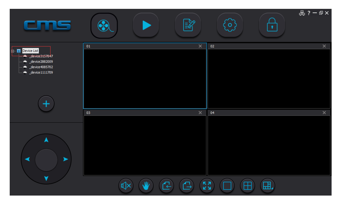
Figure 3.1 main window of devices added

After devices added, right-click root node in device list(marking of figure 3.1) and bring up operation menu, as shown figure 3.2.