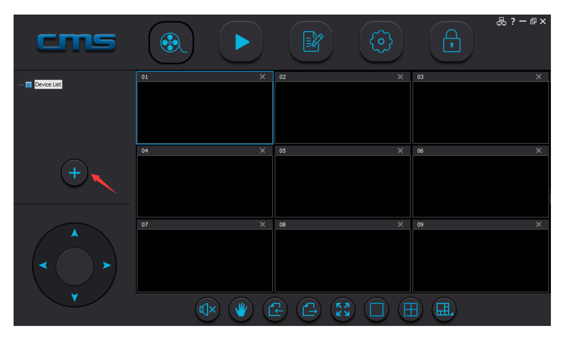
Figure 2.2 CMC main window