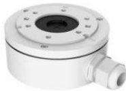
DS-1280ZJ-XS Junction Box